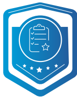
Course Completion Awards